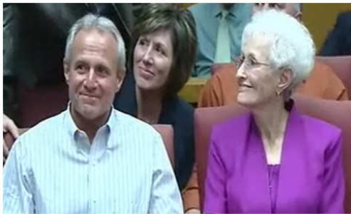
Morton with his mother and sister upon release

O ctober 4: Michael Morton was freed after serving nearly 25 years in prison for a crime he did not commit. Morton was convicted in 1987 in Williamson County, Texas, of the murder of his wife, based entirely